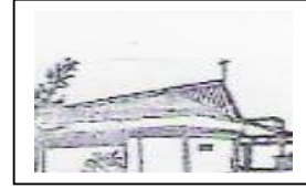
Church of the Resurrection (Henry Wells Square)

186 St. John's Road, Boxmoor, Hemel Hempstead, Herts HP1 1NR