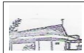
Church of the Resurrection