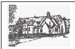
St John's Road, Boxmoor

These Parishes are part of the Archdiocese of Westminster. Registered charity No: 233699