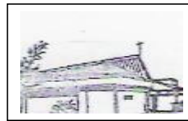
Church of the Resurrection