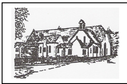
St John's Road, Boxmoor

These Parishes are part of the Archdiocese of Westminster. Registered charity No: 233699