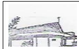
Church of the Resurrection