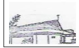
Church of the Resurrection