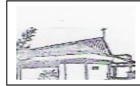
Church of the Resurrection