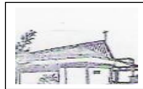
Church of the Resurrection