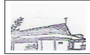
Church of the Resurrection (Henry Wells Square)

186 St John's Road, Boxmoor, Hemel Hempstead, Herts HP1 1NR